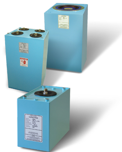
Metal Case Capacitors

Our extensive product portfolio includes all types of film and paper dielectrics, metalized and discrete foil electrodes, oil-filled and dry constructions, and a wide variety of packages. In addition to an extensive line of off-the-shelf products, GA-EMS offers customization services to meet specific application requirements and exacting voltage and capacitance specifications.