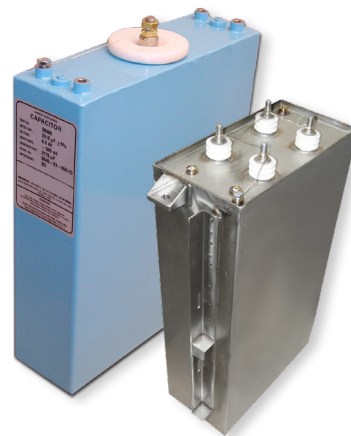
Specialized Capacitors and Components