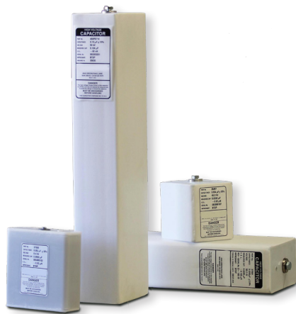
Plastic Case Capacitors