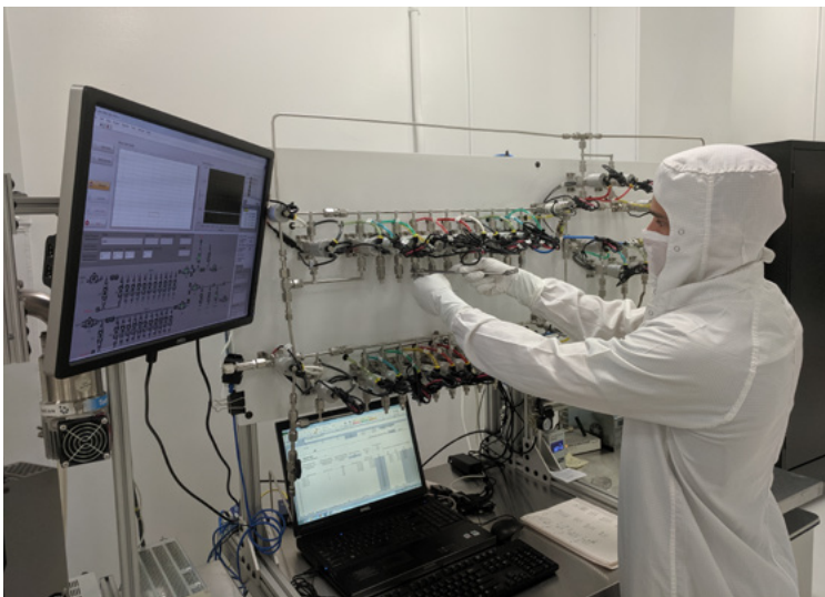
SULI student adjusts an automated mass spectrometer system as part of his research in the Inertial Fusion Technology division

What should I expect from the mentoring relationship at the laboratory? All interns will be given ongoing technical guidance and advice, from their project mentor, a professional scientist or engineer. Interns participating in person will receive appropriate materials, equipment, technical and clerical support, and office space to perform research activities. In all cases, interns can expect a professional and stimulating intellectual atmosphere.