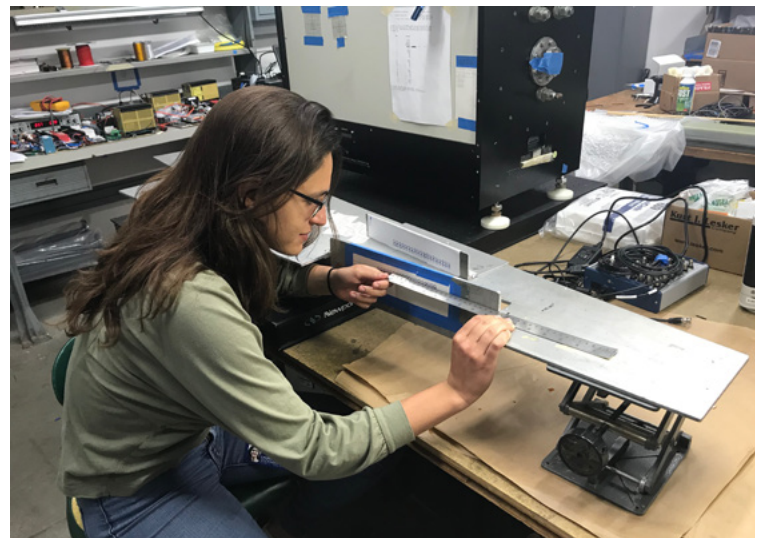
SULI student checks the spatial calibration of a charge exchange recombination spectroscopy system, as part of research into 3-D effects on plasma equilibrium

For more FAQs visit: https://science.osti.gov/wdts/suli & https://science.osti.gov/wdts/cci