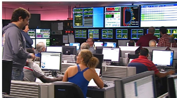
Students working in the DIII-D National Fusion Facility control room during experiments to advance fusion energy science

SULI/CCI offers selected applicants an opportunity to perform research under the guidance of laboratory staff scientists and engineers with sponsorship by the DOE.