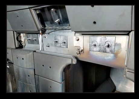
Ion Cyclotron Emission