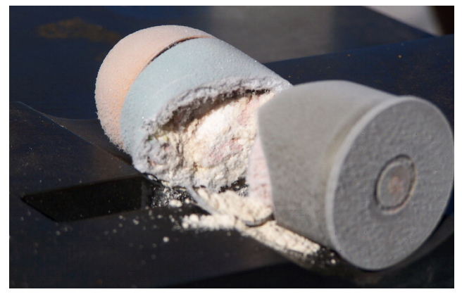
40mm HEPD grenade post cryofracture processing

ADAM mines, Rockeye II (MK 118), ICMs (M42, M46, M77), fuses, hand grenades (M69, M67, M61, M26), M16 mines, BLU 63/B, BLU 86/B, BLU 61, destructors (M10, M4, MK24), and 40 mm rounds (M406, M433).