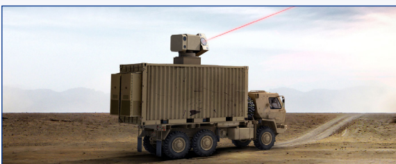
High energy Laser weapons systems (HEL)

Read more about this exciting opportunity.